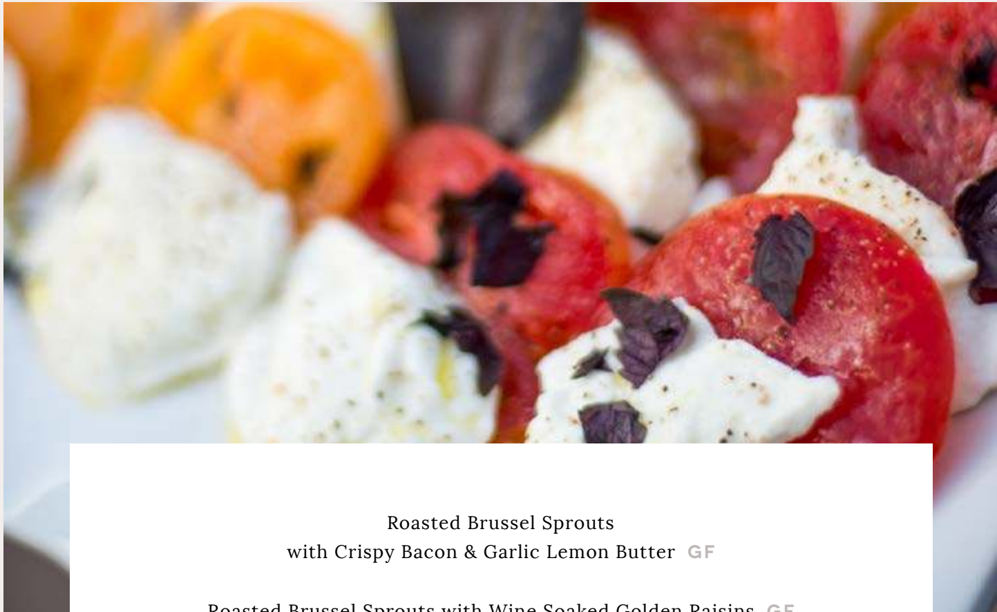
Roasted Brussel Sprouts with Crispy Bacon & Garlic Lemon Butter GF

Roasted Brussel Sprouts with Wine Soaked Golden Raisins GF