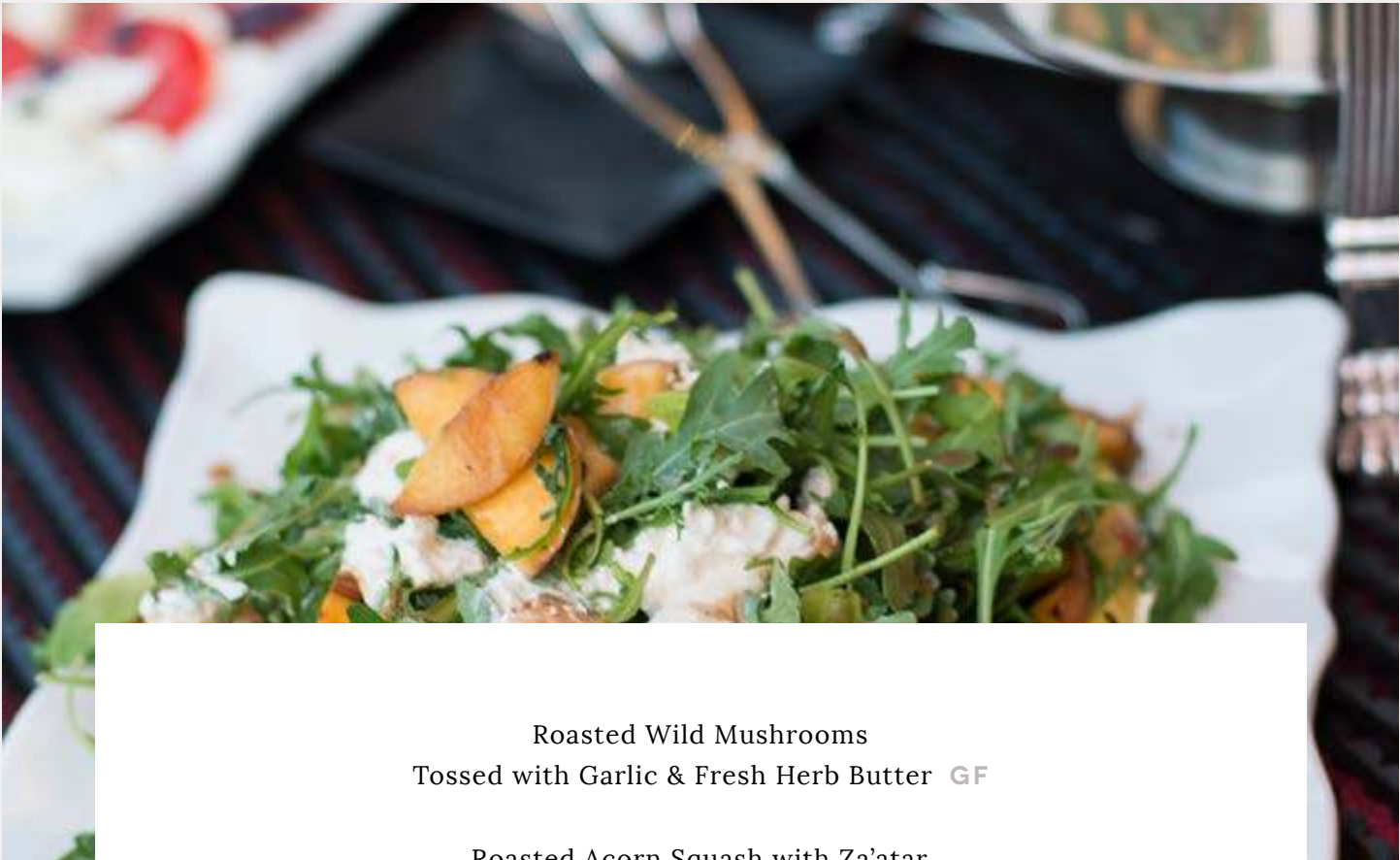
Roasted Wild Mushrooms Tossed with Garlic & Fresh Herb Butter GF

Roasted Heirloom Carrots with Almond Chimichurri GF